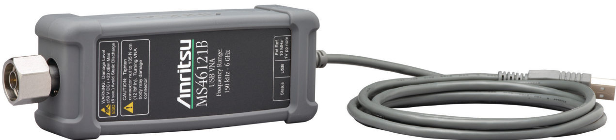
MS46121B ShockLine 1-Port USB VNA